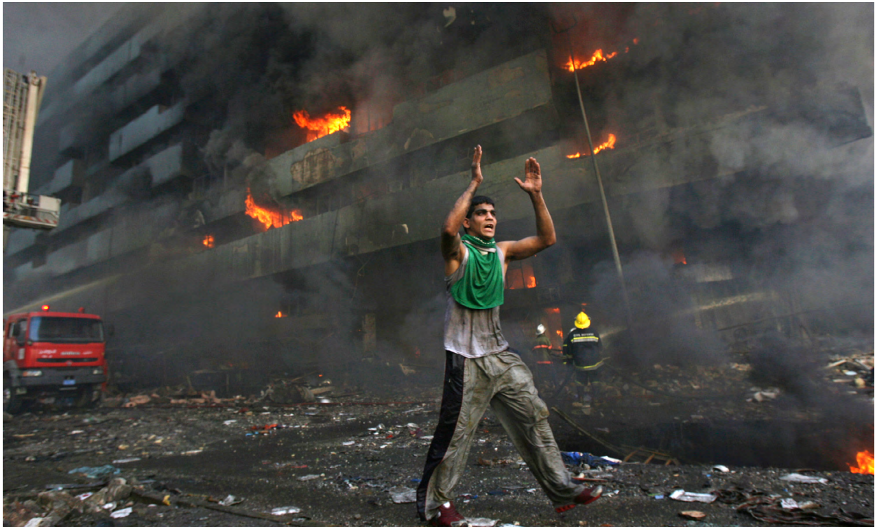
A man runs down a street warning people to flee shortly after a twin car bomb attack at Shorja market in Baghdad February 12, 2007. Three bomb attacks at markets in Baghdad killed at least 64 people and wounded 150 as Iraqis marked the first anniversary of a Shi'ite shrine bombing that pitched the country to the brink of civil war.