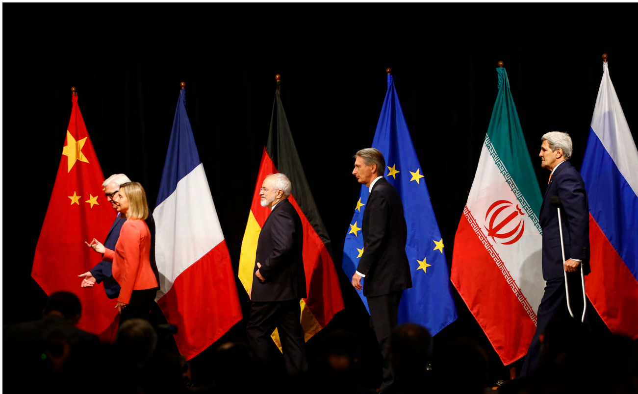
German Foreign Minister Frank Walter Steinmeier, High Representative of the European Union for Foreign Affairs and Security Policy Federica Mogherini, Iranian Foreign Minister Mohammad Javad Zarif, British Foreign Secretary Philip Hammond and U.S. Secretary of State John Kerry (L-R) arrive for a family picture after the last plenary session at the United Nations building in Vienna, Austria July 14, 2015. Iran and six major world powers reached a nuclear deal, capping more than a decade of on-off negotiations with an agreement that could potentially transform the Middle East.

always willing to intervene. As the past quarter-century of American military dominance in the Middle East has demonstrated, interference at this level is ultimately destabilizing. Absent this destabilizing effect, there would be greater space for advancing negotiated and diplomatic solutions to various conflicts in the region, notably in the Saudi–Iran and Israel–Palestine cases.