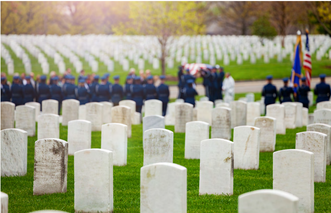
Burial procession in U.S. military cemetery.

Covid-19 now demonstrates the necessity of reorienting the priorities of the U.S. government. The coronavirus pandemic and subsequent economic crisis underscore the folly of the post-9/11 national security agenda, which has focused primarily on foreign threats, many of which originated in the Middle East, while insufficiently addressing hazards to the health and well-being of people in the United States. Indeed, much of America's overseas expenditure and military action during the past 20 years has been concentrated in this region, following the 9/11 attacks and subsequent declaration of the war on terror. Unfortunately, the vast sums the U.S. has spent in the region have had the opposite of their intended effect: They have made Americans less safe, undermined U.S. standing abroad, and rendered the country less prepared to respond to domestic threats to Americans' well-being. The region has been the epicenter of the overreach of U.S. power, the unwarranted taking of sides in local and regional conflicts, and the loss of vision as to where U.S. interests lie. This is not a phenomenon limited to any specific administration; it has been a systemic problem in U.S. foreign policy in the Middle East since at least the end of the Cold War.