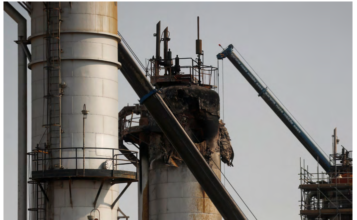
A view shows the damaged site of Saudi Aramco oil facility in Abqaiq, Saudi Arabia October 12, 2019.

Preventing a hostile hegemon does not require the United States to assume the role of regional hegemon itself. Instead, it should recognize multipolarity as a reality, appreciate it for precluding regional domination by any other state, and exploit it to protect U.S. interests. In the absence of any emerging regional hegemon, the United States has little stake in the ebb and flow of most conflicts among regional actors, apart from a permanent interest in avoiding the escalation of conflicts with wider destabilizing effects. There is no justification for rigidly dividing the region into ostensibly good actors and bad ones and tilting scales in favor of the former and against the latter. The United States is well served by a multipolar balance of power, in which any aggressive inclinations on the part of any regional actors are deterred or otherwise held in check by regional rivals. Security in the Middle East is inherently the responsibility of Middle Eastern states, with the United States serving as a balancer from a distance only when balancing is required.