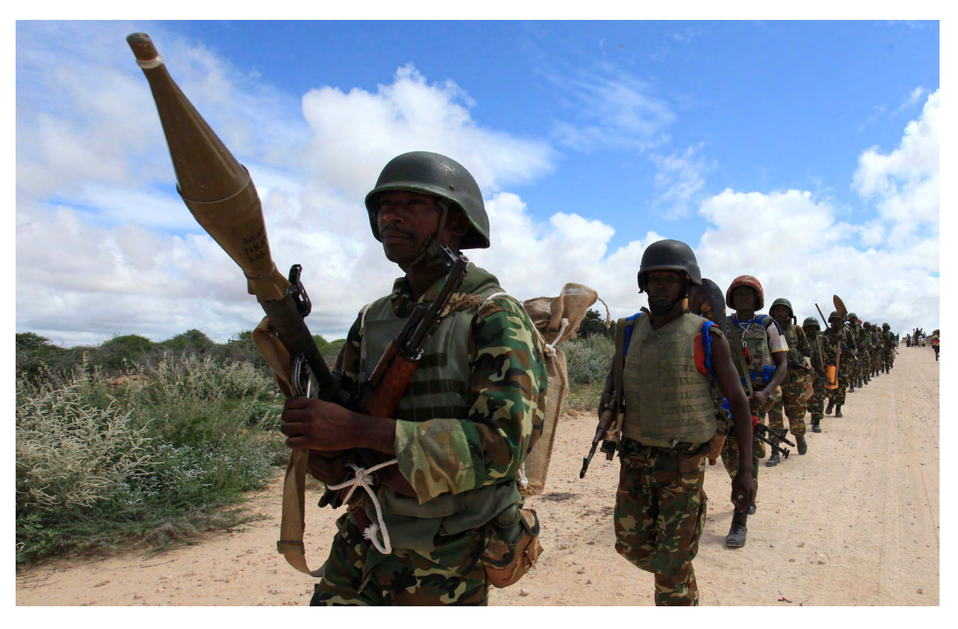
African Union Mission in Somalia (AMISOM) peacekeepers from Burundi patrol after fighting between insurgents and government soldiers erupted on the outskirts of Mogadishu, Somalia, May 22, 2012.

counterterror mission over all other interests. Similarly, the United States has turned a blind eye to the destabilizing acts of Uganda's military in South Sudan and the Democratic Republic of Congo.