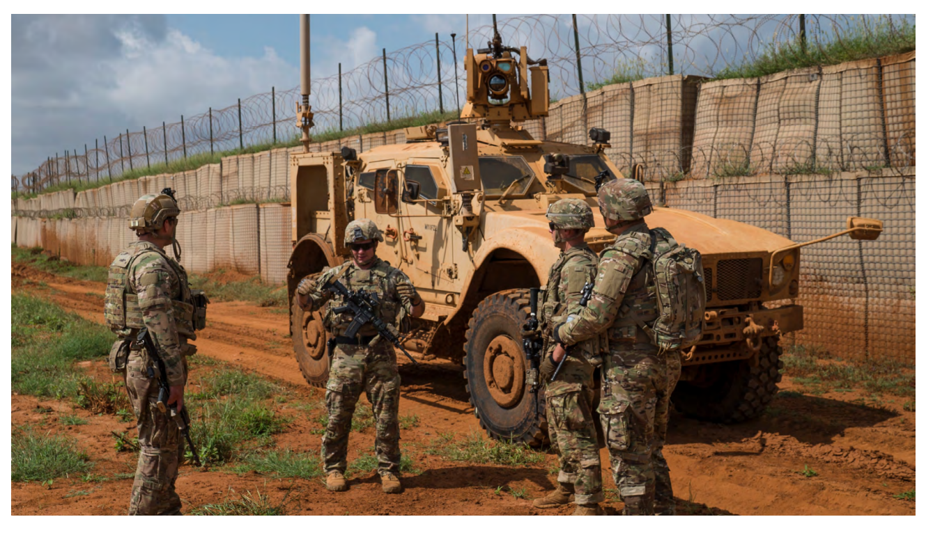
U.S. Army Soldiers, assigned to Task Force Guardian, 41st Infantry Brigade Combat Team (IBCT), 1–186th Infantry Battalion, Oregon National Guard, discuss security patrol operations during a security patrol stop in Somalia. The 41st IBCT provides base security and force protection for Combined Joint Task Force-Horn of Africa personnel and partner U.S. forces deployed in Somalia. December 3, 2019.

With a military victory out of reach, improving the circumstances of civilians living under al-Shabaab's influence will require nonmilitary engagement, and some level of compromise. Political negotiation will be necessary to end the war.<sup>42</sup> Negotiation also offers an opportunity to peel off the less-extreme arms of the organization, which is known to have members of varying levels of commitment to the extremist mission. Concern regarding atrocities can and should be addressed by incorporating transitional justice mechanisms into any peace settlement, and human rights considerations must be incorporated into any political agreements. At the same time, questions should be raised about how ethical it is to participate in dragging out a war and attenuating the human costs associated with it, which remain substantial. If we recognize that we cannot end the war through military means, we also have a moral obligation to look for other ways to end a war we helped create.