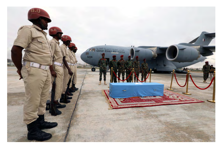
Somali government soldiers pay their respects next to the flag-draped casket of Mogadishu Mayor Abdirahman Omar Osman, who died after a suicide bomb attack in his offices in August 2019.

The U.S. should work toward a clear end to military intervention, but a responsible withdrawal period could leverage military assistance to promote political and governance priorities. Lacking the weight and influence of U.S. military assistance, diplomatic and development efforts to steer the FGS to address governance and political controversies have thus far fallen short. In addition to reinforcing diplomatic capacity in Somalia, conditioning sought-after military support could also help incentivize positive developments in these areas.37 In a country such as Somalia, where U.S. assistance is already robust, this would require a recalibration. A strong diplomatic effort could help frame this approach as a positive joint effort associated with a broader pursuit of shared objectives, so as to incentivize positive actions rather than punish harmful ones. The plan should lay out clearly identifiable conditions at the outset along with ultimate objectives and achievable intermediate milestones. Mogadishu should participate in negotiating the roadmap for how certain reform benchmarks can unlock military assistance, building in joint ownership and ensuring that compliance benefits U.S. and Somali interests alike.<sup>38</sup>