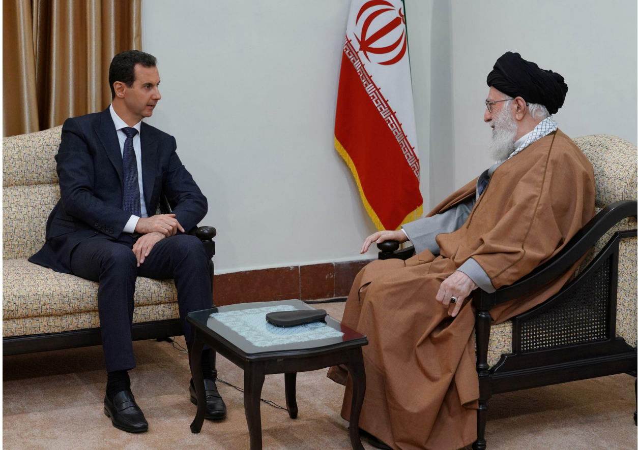
Syrian President Bashar al-Assad meets with Iranian Supreme Leader Ayatollah Ali Khamenei in Tehran, Iran in this handout released by SANA on February 25, 2019.

So does conventional American wisdom about the region tend to focus on a singular villain whose purported raison d'être is to export chaos.