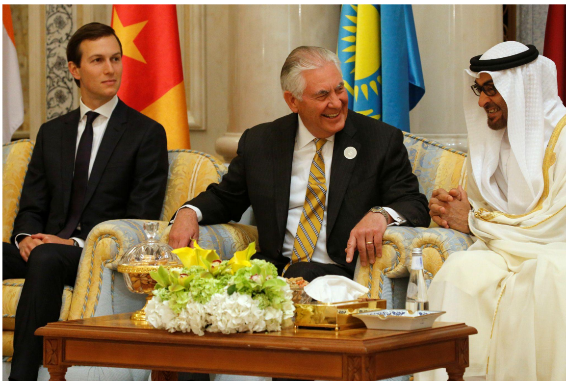
U.S. Secretary of State Rex Tillerson, flanked by White House senior advisor Jared Kushner (L), speaks with Abu Dhabi Crown Prince and Deputy Supreme Commander of the United Arab Emirates (UAE) Armed Forces Mohammed bin Zayed al-Nahyan during the Gulf Cooperation Council leaders summit in Riyadh, Saudi Arabia May 21, 2017.

Technologies also proliferated. Turkey, after seeing the counterinsurgency benefits of intelligence gathered by U.S. and Israeli drones, invested heavily to develop an