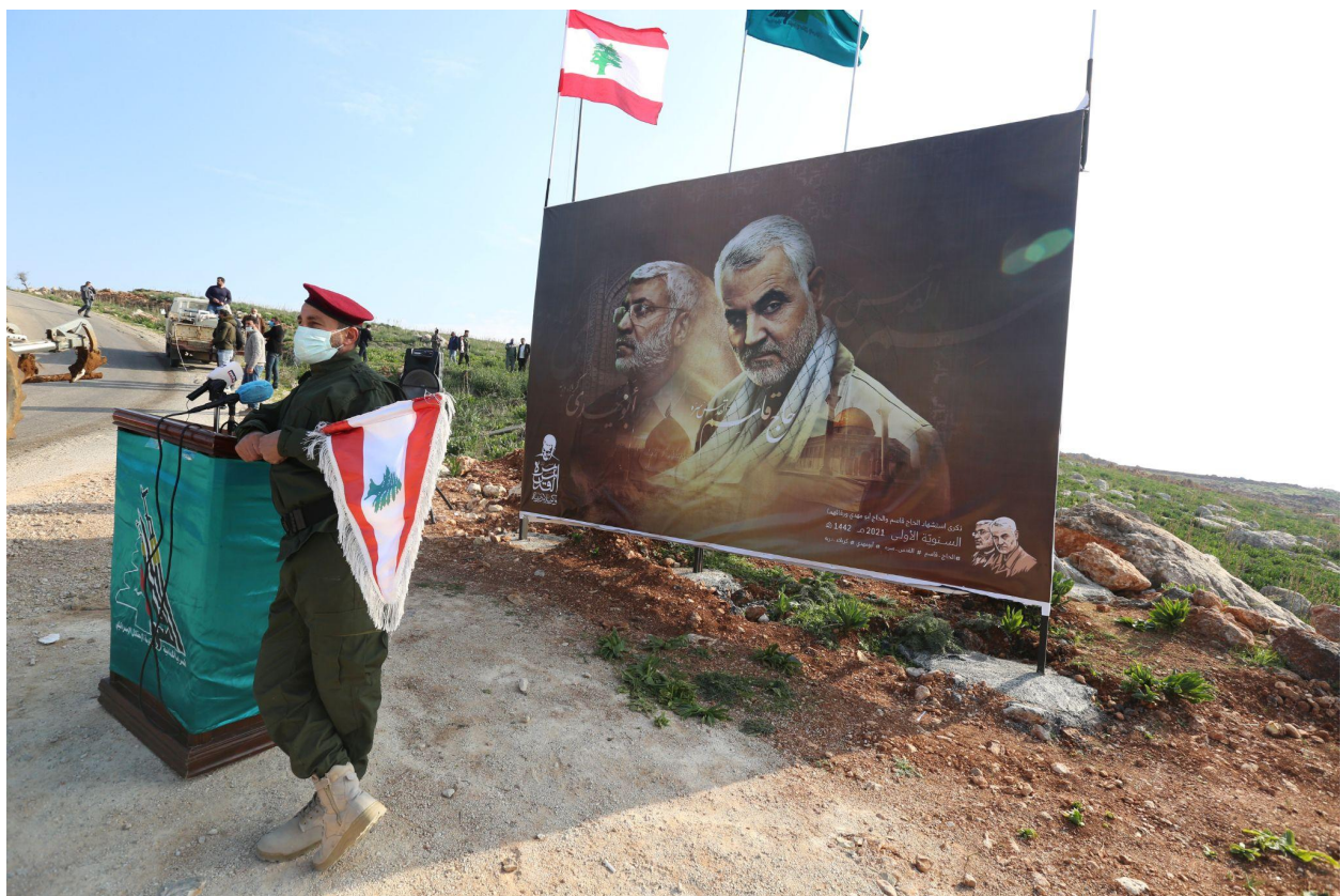
A member of Lebanon's Hezbollah holds a Lebanese flag as he stands in front of a picture depicting senior Iranian military commander General Qassem Soleimani and Iraqi militia commander Abu Mahdi al-Muhandis who were killed in a U.S. attack, during a ceremony marking the first anniversary of their killing, in the southern village of Khiam, Lebanon January 3, 2021.

Contrary to a narrative promoted by opponents of the 2015 Joint Comprehensive Plan of Action, the accord governing Iran's nuclear programs, the data do not support the argument that the Iran nuclear agreement — and the subsequent lifting of many international economic sanctions — drove regional interventionism by enabling Iranian expansionism. The fundamental nature and geographic extent of Iran's interventions did not change during this period. Nor do the data provide any evidence that the Trump administration's "maximum pressure" campaign changed Iran's behavior, as was its intent.