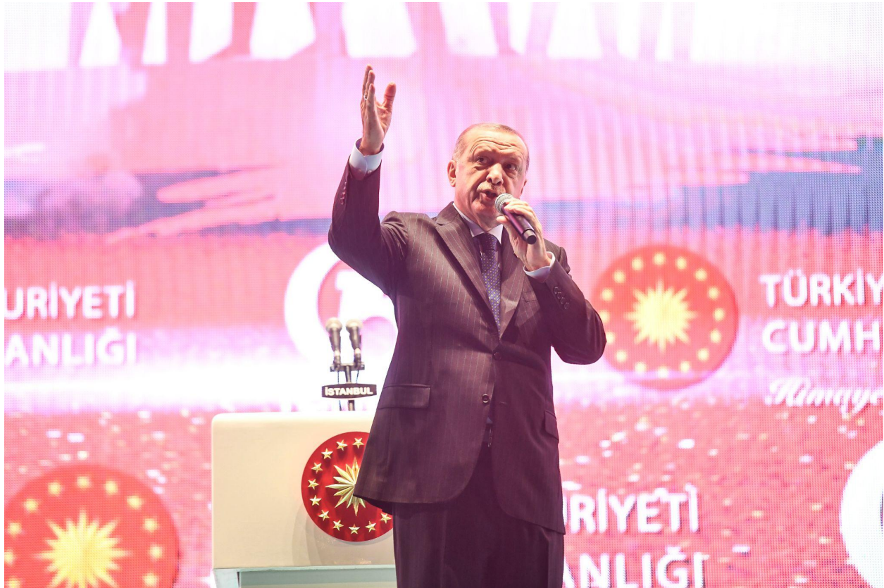
July 15, 2018 — Turkey's President Recep Tayyip Erdogan, in Istanbul, delivers a speech celebrating the second anniversary of the defeat of a military coup against his rule.

visibility, Iran neither expanded nor shrank the geographic reach of its operations. 17 Any further movement in Iran's interventionism score reflected the fluctuating intensity of the conflicts it was involved in.