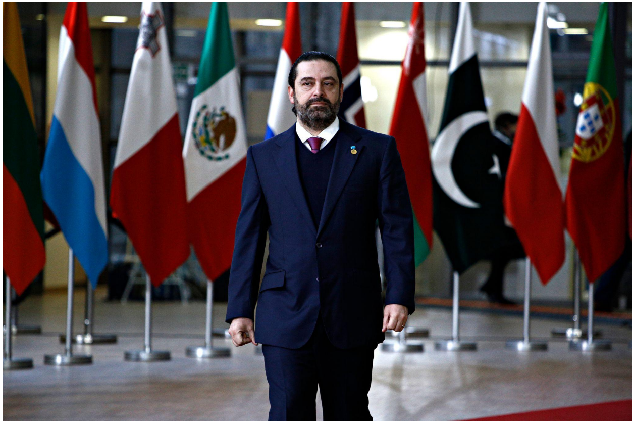
Brussels, Belgium, March 14, 2019 — Lebanon's then-Prime Minister Saad Hariri arrives to attend an international conference on the future of Syria and the region. Hariri was kidnapped by the Saudi government in 2017 in an apparent bid to curb Iranian influence in Lebanon.

painting an even more urgent picture of the situation: “Bashar Assad and the Ba’ath Party are drowning to their necks in a quagmire. Nothing is left until they completely drown... First we have to get Bashar and the Syrian government outside the quagmire; then, we’ll clean them, give them clothes, feed them, ask them to study and do their prayers.” 53 However, other states saw Iranian aggression, as Iran brought in foreign forces to impose an illegitimate and dangerous regime on an unwilling population. 54