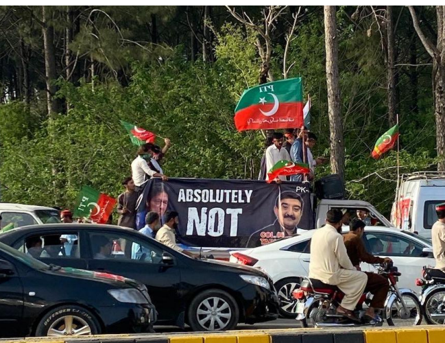
Left: PTI supporters gather in Islamabad to hear then prime minister Imran Khan speak on March 27, 2022. Khan was removed via a no confidence vote two weeks later on April 10, 2022; Right: During an interview with Axios broadcast June 21, 2021 on HBO, then prime minister Imran Khan responded "absolutely not" when asked if Pakistan would hypothetically allow the U.S. to use bases on its soil to launch military operations. It became an unofficial slogan.